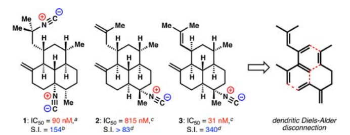
Figure 1. Antimalarial amphilectenes. <sup>a</sup>IC<sub>50</sub> ( P. falciparum K1); <sup>b</sup>S.I. = IC_{50} (human fibroblast)/a; {}^{c}IC_{50} (P. falciparum W2); {}^{d}S.I. = IC_{50} (human fibroblast)/c.

n 2009, clinicians working along the Thai—Cambodia border confirmed reports of malaria infections that showed decreased susceptibility to artemisinin-combination therapies (ACT), which are the standard of care for treating malignant malaria ( P. falciparum ). The incidence of artemisinin resistance is on the rise,<sup>2</sup> with some communities reporting reduced ACTsensitivity in 50% of the patient population. 36 Consequently, there is an urgent need to identify, produce, and analyze promising new drugs for the treatment of malaria.<sup>3</sup> The isocyanoamphilectenes (e.g., 1-3, Figure 1) are marine